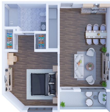
B5 542 SQ FT