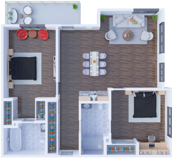
C1 967 SQ FT