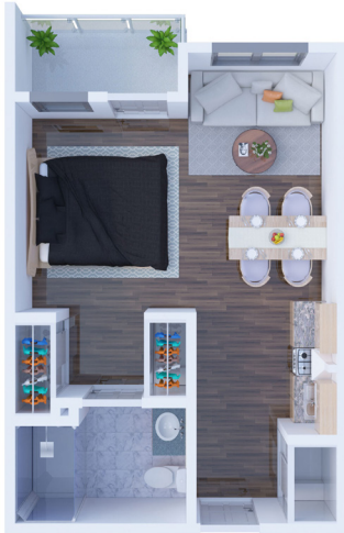
A1 404 SQ FT

Solstice at East Amherst offers several floor plan choices to suit your needs.