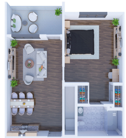
B11 553 SQ FT

Solstice at East Amherst 6363 Transit Road | East Amherst, NY 14051 844.311.6616 SolsticeAtEastAmherst.com