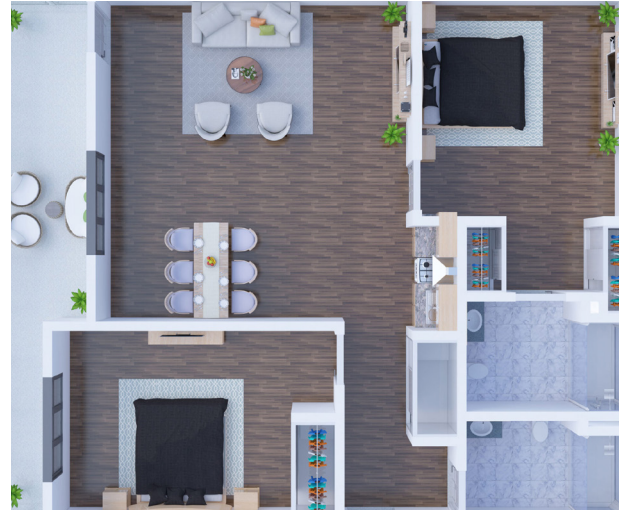
C2 967 SQ FT