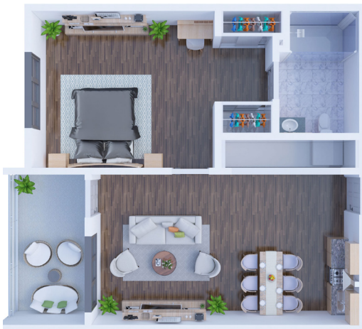
B1 549 SQ FT