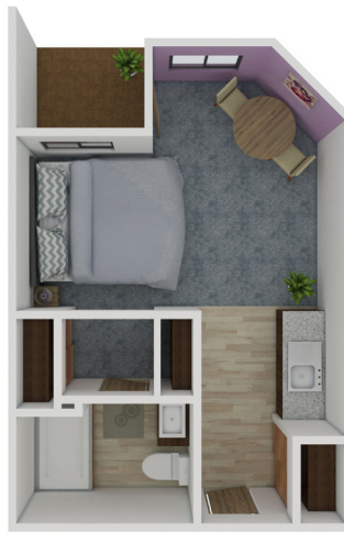
A5 388 SQ FT