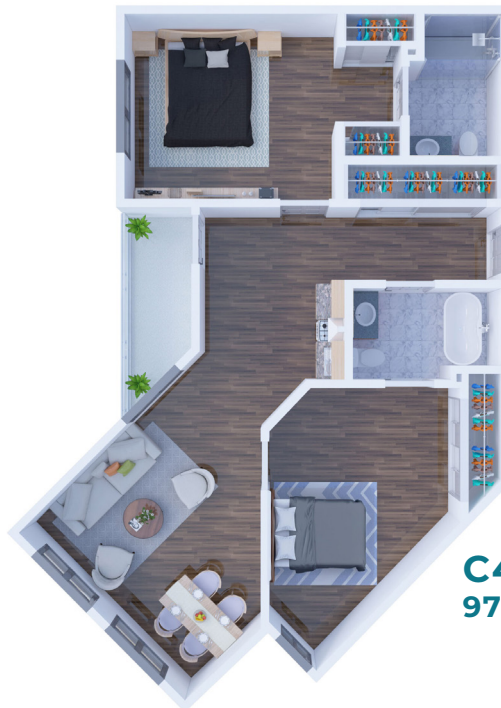
C4 971 SQ FT