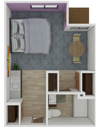
A9 426 SQ FT